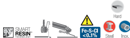
1/8" TYPE 27