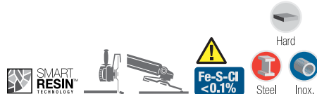
1/8" TYPE 27