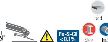
1/4" TYPE 27