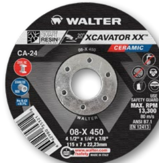
1/4" TYPE 27